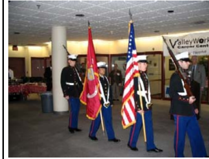
The Haverhill High School Marine Corps Junior ROTC Color Guard opened the Salute to Veterans Job Fair with a procession and led the audience in the Pledge of Allegiance.

On Tuesday, November 9, ValleyWorks held its first Salute to Veterans Job Fair, attracting several hundred job seekers who met with 15 area businesses at the event, which was held at the Haverhill Career Center.