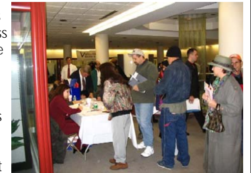
EMSI, Inc. of Billerica drew a steady crowd throughout the job fair.

More BSU-sponsored events are scheduled throughout 2005; Lucent Career Center members are welcome to attend any appropriate BSU event. For more information on upcoming events, go to the ValleyWorks Web site at www.Valleyworks.cc/events .